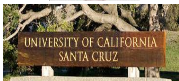
Some of many international ties with CRD