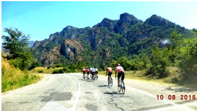
On the road from Haghartzin to Ijevan.