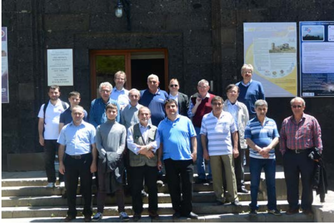
Participants in the LEAD Workshop at CRD's Nor Ambert research and conference center in Armenia.

Despite lightning and thunderstorms being a common phenomenon, their underlying physics is still not well understood. Thunderstorms often cause significant economic damage and endanger lives. Experiments at CRD's Aragats Research Station at 10,500 ft. elevation recorded multiple features of thunderstorms and lightning together with relevant meteorological parameters.