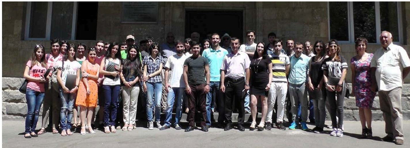
Advanced Science Summer School participants from Yerevan State University and Armenian State Pedagogical University with instructors from Yerevan Physics Institute

The advanced Science Summer School in High-Energy Physics, Atmospheric and Cosmic Ray Physics, and Particle Accelerator Physics was held from August 17 to 20 at the Yerevan Physics Institute (YerPhI), named in honor of its founder - Artem Alikhanyan.