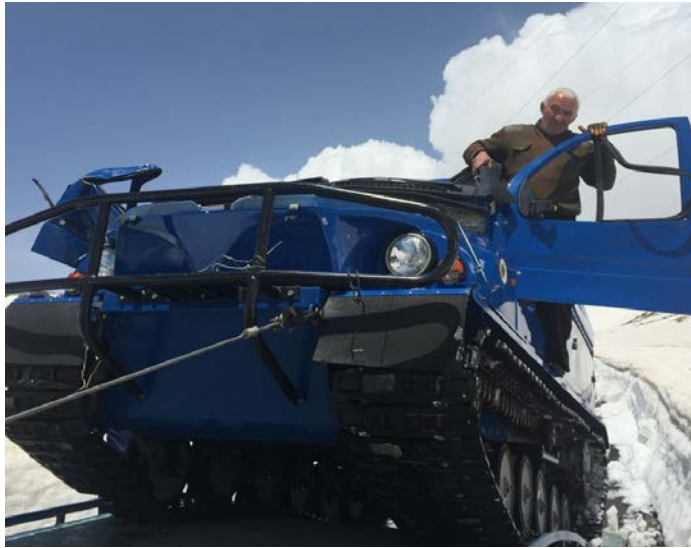
Retrieving the BOBR snow travel vehicle from the valley below Mt. Aragats.

In 2010, CRD's good friends at the Armenian Scientists and Engineers of America, Michigan Section, bought a much needed snow travel vehicle for the Cosmic Ray Division's winter shift changes. The Russian-made vehicle, called a BOBR, served its purpose very well for the last 5 years.