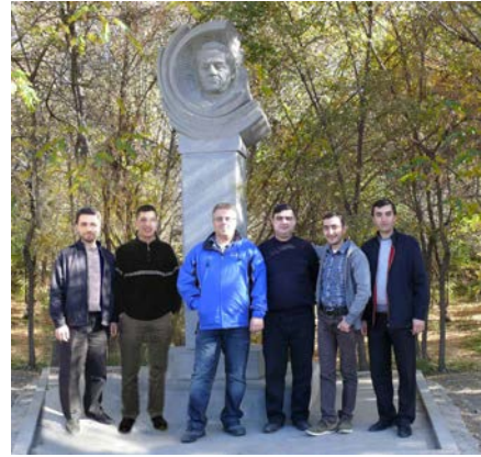
CRD’s young scientists and engineers discovering the universe