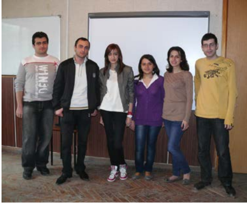
Next generation of scientists conducting their PhD thesis at CRD