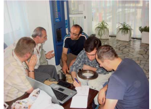
Discussing aspects of the SEVAN detector