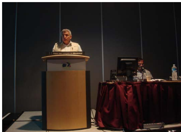
Professor Ashot Chilingarian at the COSPAR Congress

The Canadian Space Agency and the National Research Council of Canada co-sponsored the weeklong 37th COSPAR Congress in July 2008. More than 2,500 scientists and students from 50 countries attended the meeting. 1,500 reports were presented in more than 87 sessions covering all topics of space research.