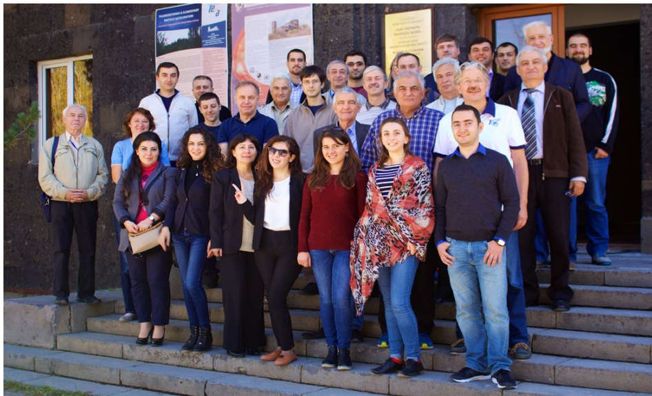
Some of the TEPA2016 participants at CRD's Nor Ambert International Conference Center.