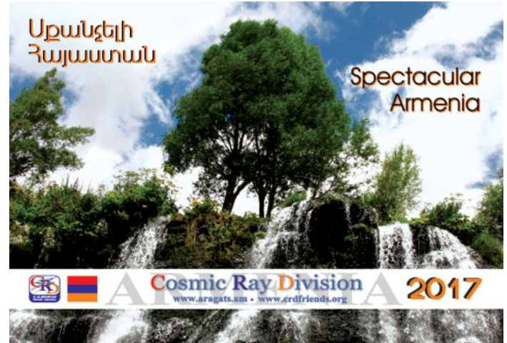
2017 Spectacular Armenia Calendar available for purchase on the website and selected stores