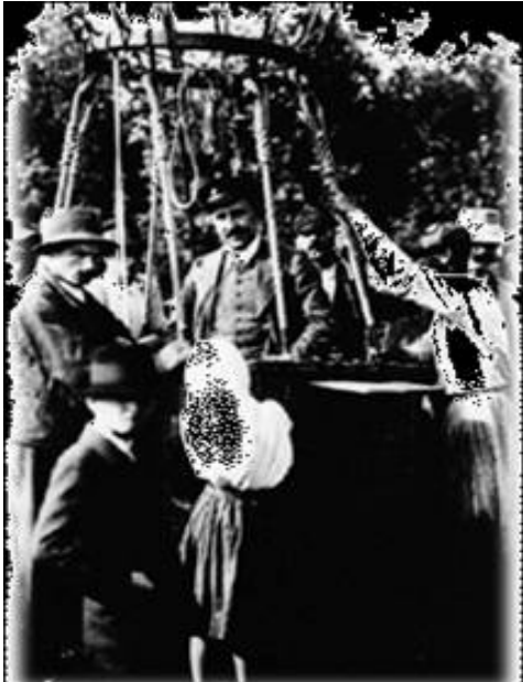
Victor Hess and his first Cosmic Ray Detector

Cosmic rays are subatomic particles originating from space. Cosmos means space in Greek. These particles, invisible to the naked eye, are detected with sophisticated instrumentation and analyzed with special mathematical algorithms. Physicist Victor Hess was the first to discover Cosmic Rays in 1913.